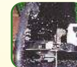
Radiator with Overflow Reservoir