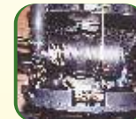
Dry Type Air Filter