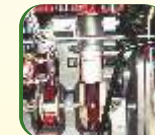
Oil Jet for Piston Cooling