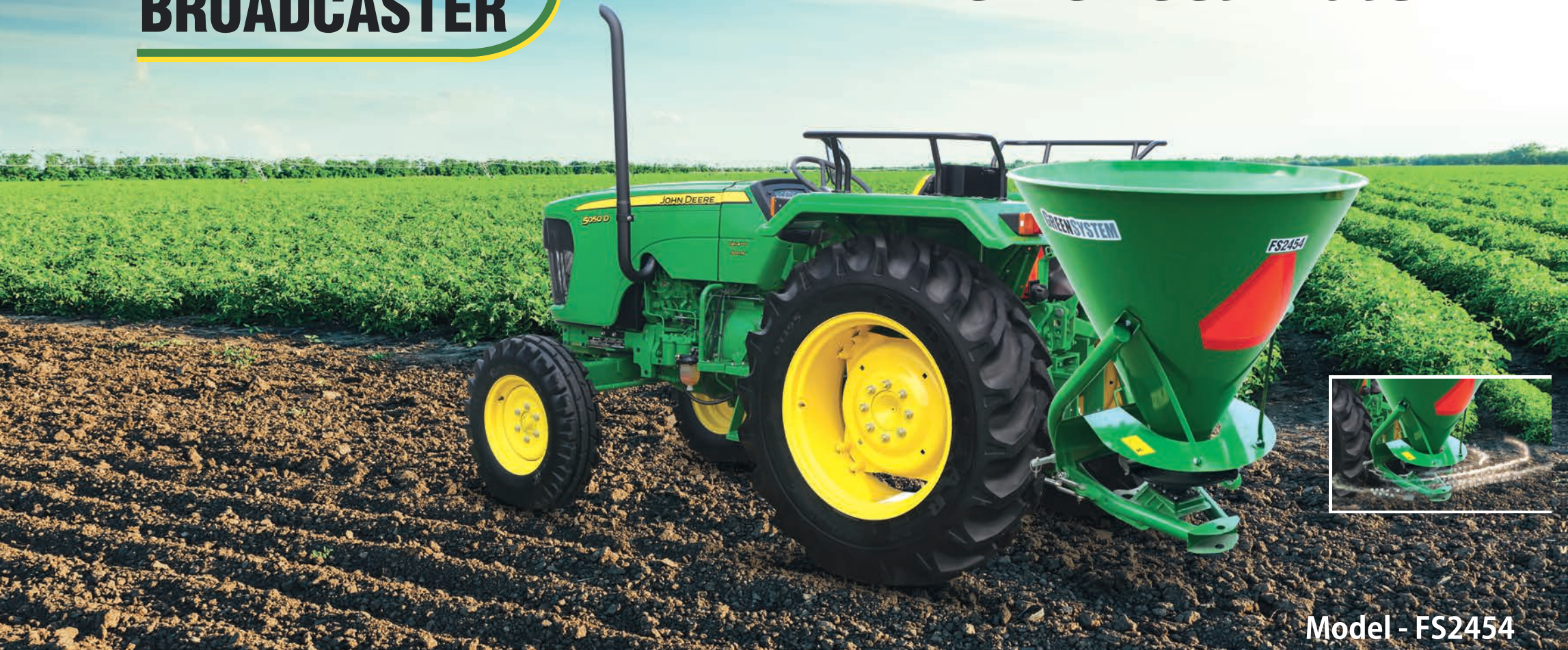
Model - FS2454

Specially designed for John Deere 5000 series tractors